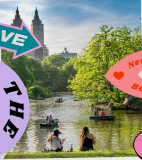
Love Central Park