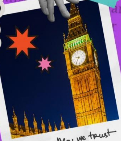
In Big Ben we trust